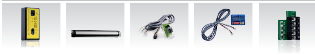
Spotfinder Rain Accessory Fire Door Adapter Multisensor hub Retrofit interface